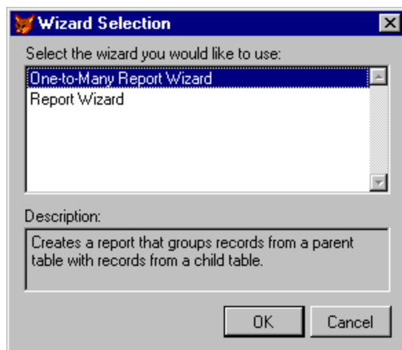
Figure 1. Use the Wizard Selection dialog to choose whether you want to create a one-to-many report or a single-file report.

The first step in using the Report Wizard is choosing which type of report you want to create. Select Tools | Wizards | Report from the main VFP Menu bar to display the dialog shown in Figure 1.