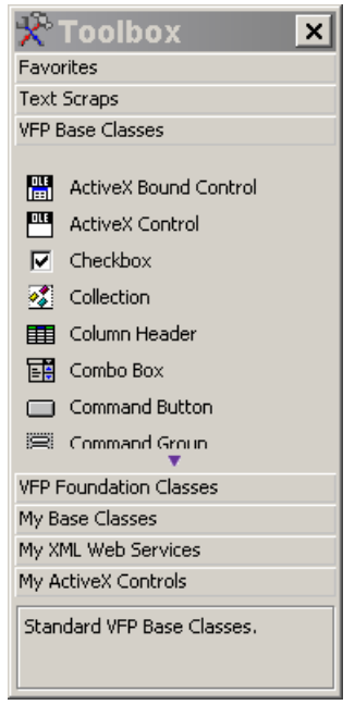
Figure 1. The Toolbox. The Toolbox offers a marriage of the Form Controls toolbar and the Component Gallery.

The Toolbox (shown in Figure 1 ) is the new preferred tool for adding controls to forms and classes. It combines the simplicity of the Form Controls toolbar with the flexibility of the Component Gallery to provide a tool better than either.