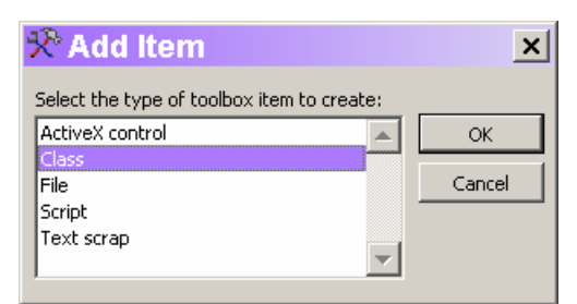
Figure 7. Adding an item. The first step is to indicate the type of item.

Once you choose an item type, you specify the item. The exact sequence of steps varies with the Item type. For Class and File, the Open dialog appears to let you specify the class library (VCX or PRG) or file (any type at all).